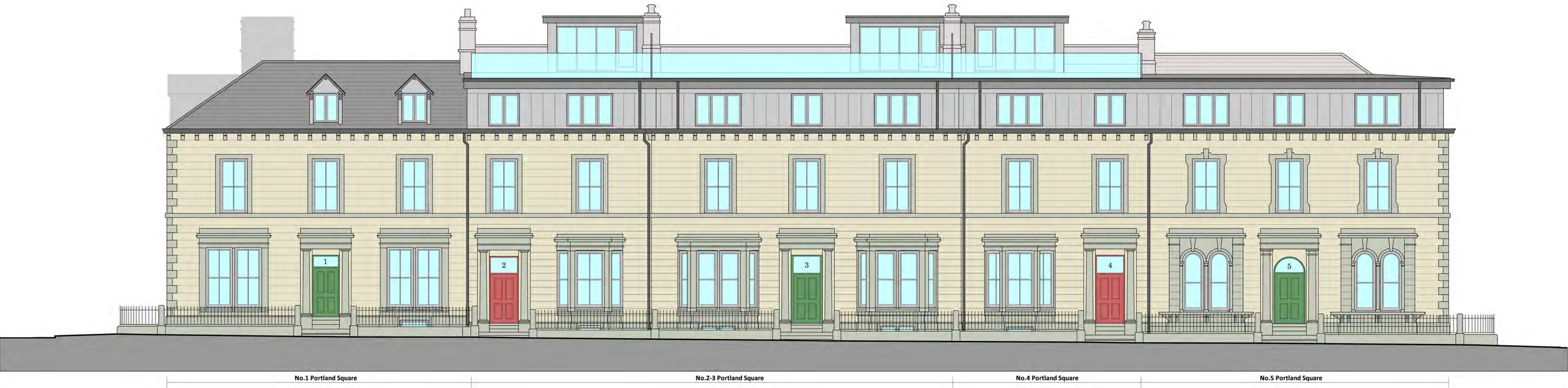
FRONT ELEVATION, 1-5 PORTLAND SQUARE