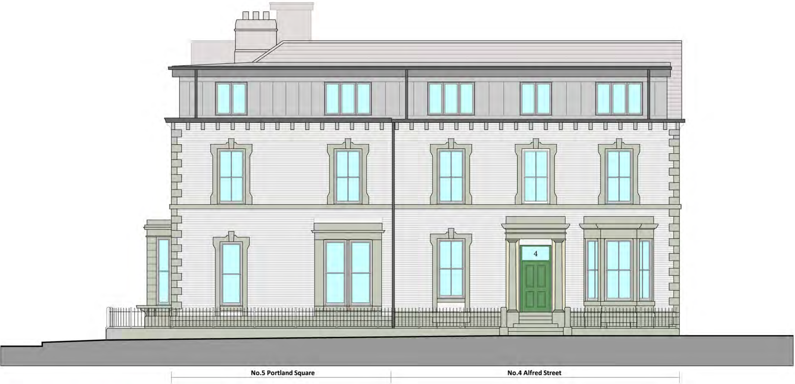
SIDE ELEVATION, ALFRED STREET NORTH