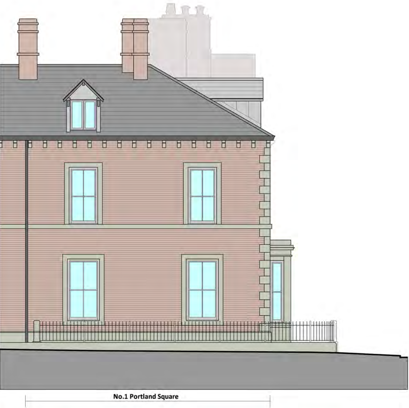
SIDE ELEVATION, BRUNSWICK STREET