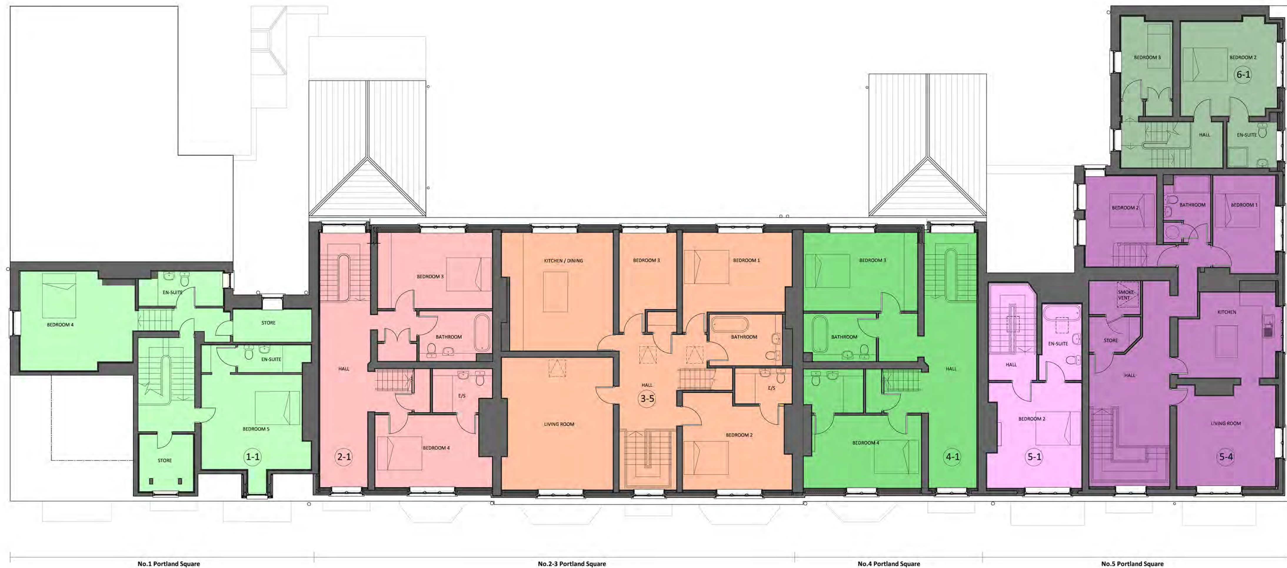
PROPOSED - SECOND FLOOR PLAN